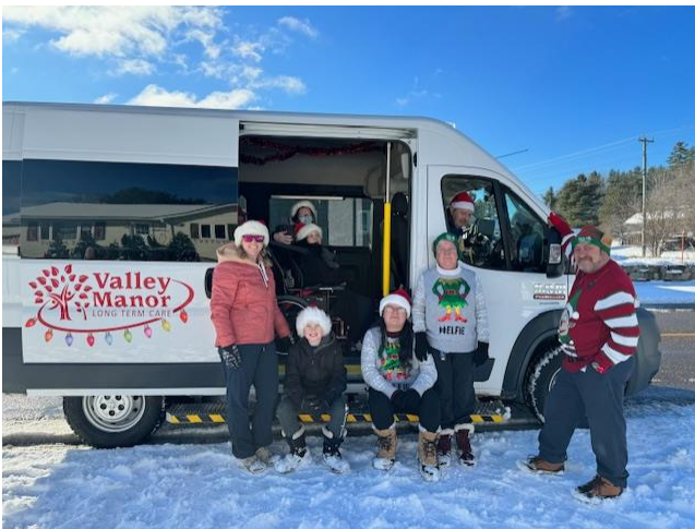
Staff, residents and the new Valley Manor van participating in the Barry's Bay Christmas parade.

Please enjoy this addition of our newsletter.