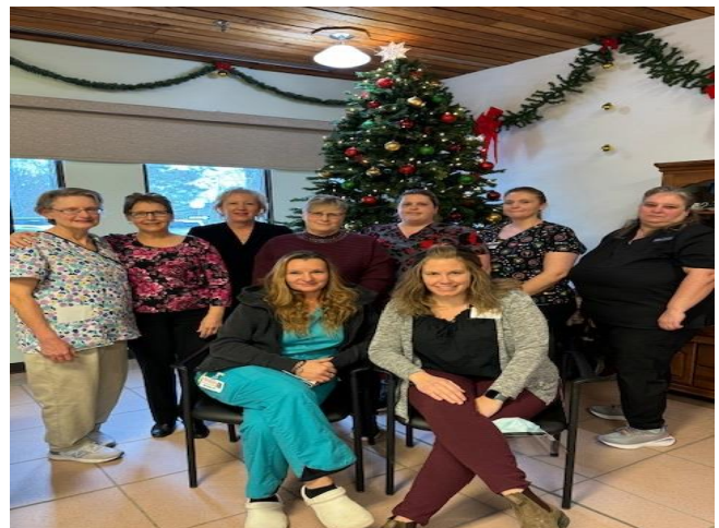
2023 Staff Anniversary Awards Luncheon & Party